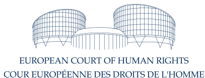
EUROPEAN COURT OF HUMAN RIGHTS COUR EUROPÉENNE DES DROITS DE L'HOMME