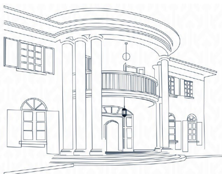
INTER-AMERICAN COURT OF HUMAN RIGHTS